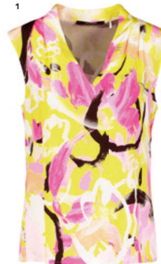
1 / BLOUSE 560313 11019 4142 100 % CVE € 59,99