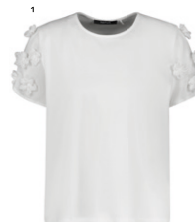
1 / SHIRT 571325 16130 9700 61 % CV, 39 % PA € 69,99