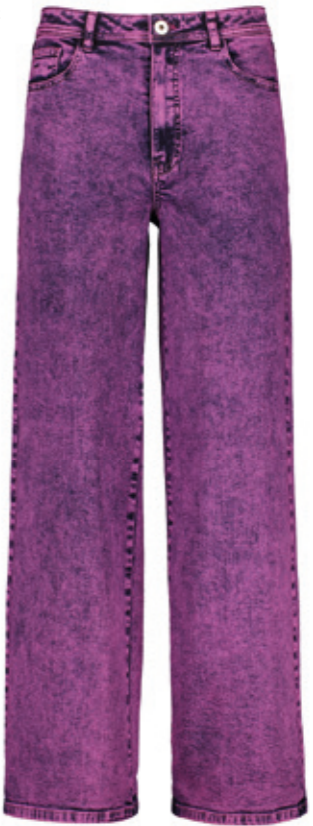
2 / TROUSERS 520348 11407 3421 95 % CO, 3 % EME, 2 % EL € 99,99