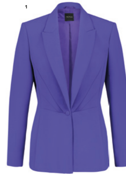
1 / BLAZER 530302 11054 8810 92 % PES, 8 % EL € 159,99