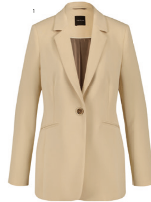
1 / BLAZER 930994 19899 9280 95 % PES, 5 % EL € 99,99