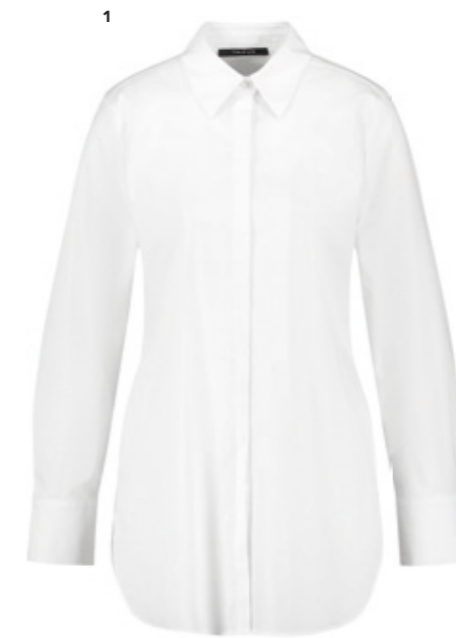
1 / BLOUSE 560303 11005 9700 71 % CO, 25 % PA, 4 % EL € 89,99