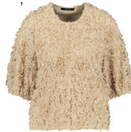
1 / SHIRT 571324 16129 9280 92 % PA, 8 % EL € 69,99