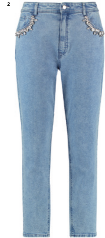
2 / TROUSERS 520313 11403 8959 99 % CO, 1 % EL € 99,99