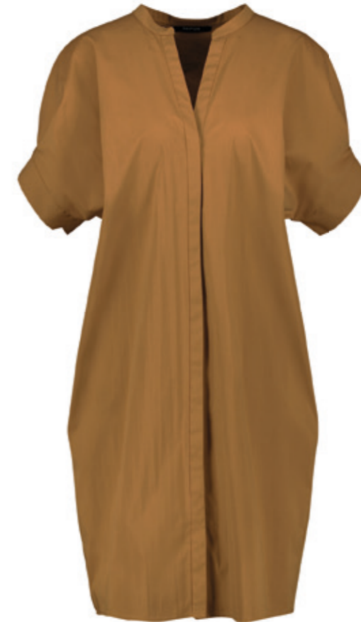
DRESS 980966 19140 7400 71 % CO, 25 % PA, 4 % EL € 99,99