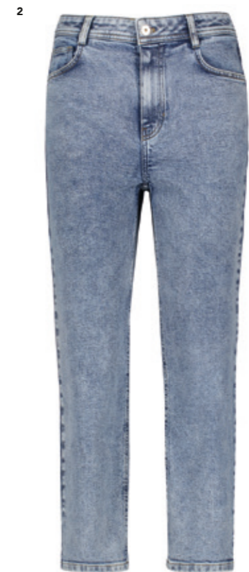
2 / TROUSERS 520319 11406 8969 99 % COR27, 1 % EL € 99,99