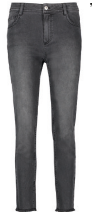
3 / TROUSERS 520310 11400 2989 72 % COR12, 27 % PESR, 1 % EL € 89,99