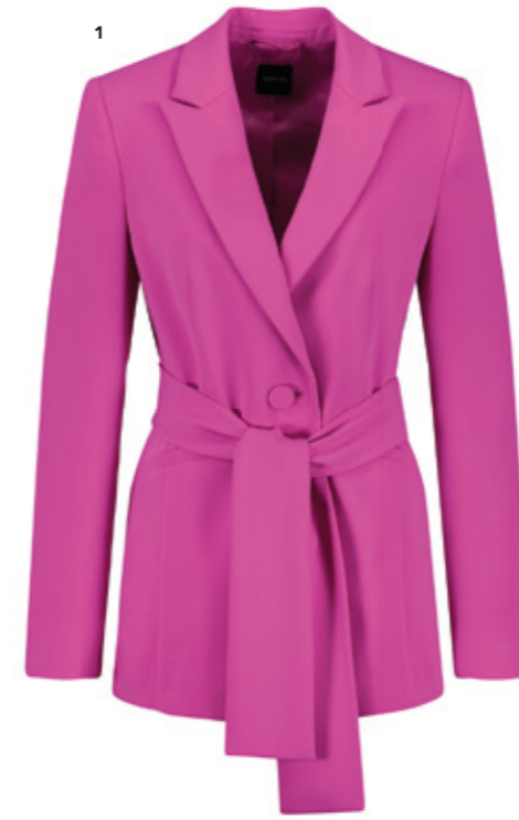
1 / BLAZER 530304 11055 3420 92 % PESR54, 8 % EL € 159,99