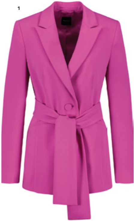
1 / BLAZER 530304 11055 3420 92 % PESR54, 8 % EL € 159,99