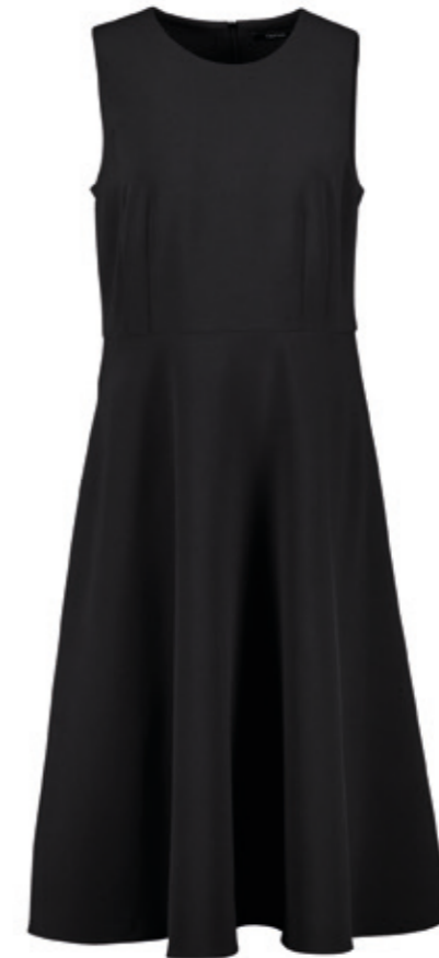
DRESS 980967 19899 1100 95 % PES, 5 % EL € 119,99