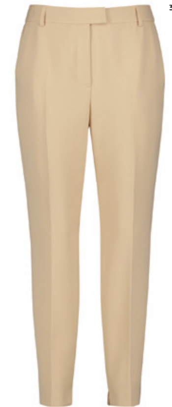
3 / TROUSERS 920973 19899 9280 95 % PES, 5 % EL € 99,99