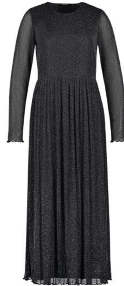
DRESS 581302 16111 2270 80 % PA, 20 % MPES € 119,99