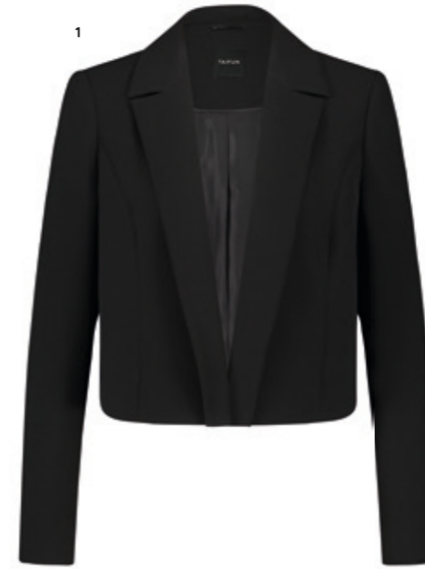
1 / BLAZER 930993 19899 1100 95 % PES, 5 % EL € 149,99