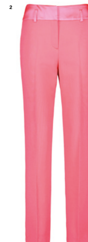
2 / TROUSERS 520302 11051 3430 76 % PES, 20 % CV, 4 % EL € 99,99