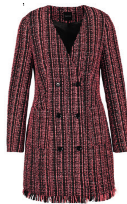
1 / BLAZER 530307 11515 1102 90 % PES, 10 % WO € 169,99