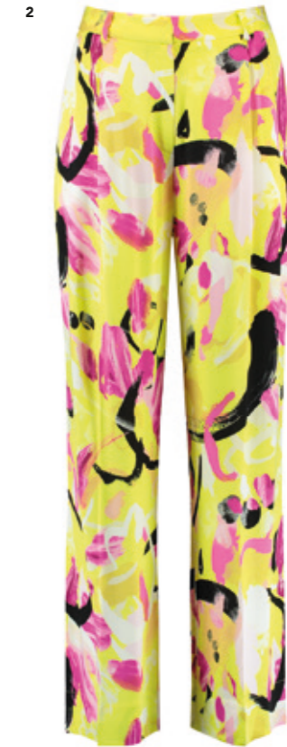
2 / TROUSERS 520308 11019 4142 100 % CVE € 99,99