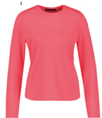
2 / SHIRT 571305 16116 3430 95 % PES, 5 % EL € 49,99