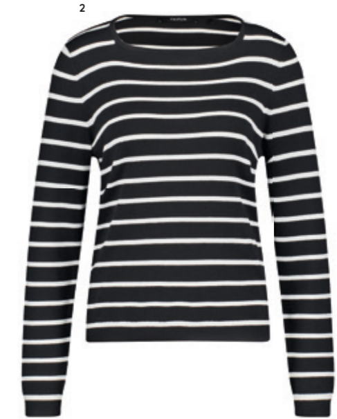
2 / PULLOVER 972951 19501 1103 80 % CVE, 20 % PA € 59,99