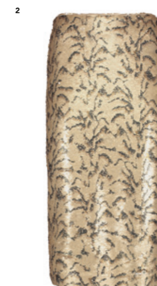
2 / SKIRT 510308 11062 9282 100 % PES € 99,99