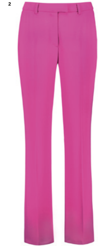
2 / TROUSERS 520307 11055 3420 92 % PESR54, 8 % EL € 99,99