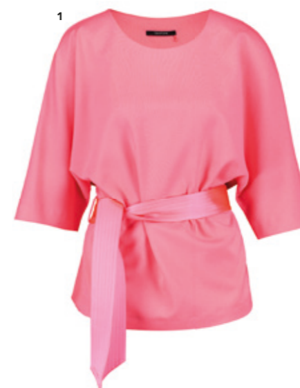
1 / BLOUSE 560357 11051 3430 76 % PES, 20 % CV, 4 % EL € 119,99