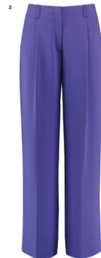
2 / TROUSERS 520303 11054 8810 92 % PES, 8 % EL € 99,99