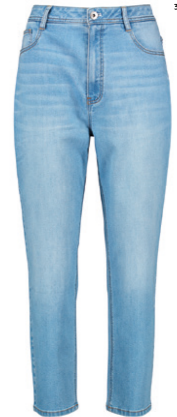
3 / TROUSERS 920972 19852 8969 67 % CO, 28 % PES, 3 % CV, 2 % EL € 99,99